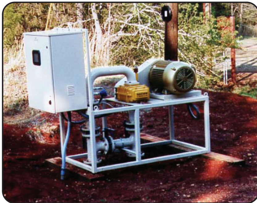
GB-40 Gas Blower at work in Alabama.

Most operators of GB-40 Series have realized increased gas production volumes great enough to offset the initial investment in the first 60–90 days.