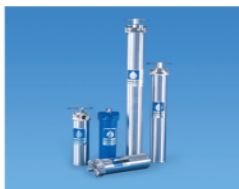
#3 and #4 size Housings

Shelco® manufactures a full line of filter housings. From our rugged single element housings to our heavy-duty multi-rounds and bag housings, we have the right filter for your requirement. Shelco® is the perfect choice for your problem solutions.