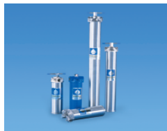
Single Cartridge Housings

Shelco manufactures a full line of filter housings. From our rugged single element housings to our heavy-duty multi-rounds and bag housings, we have the right filter for your requirement. Shelco is the perfect choice for your problem solutions.