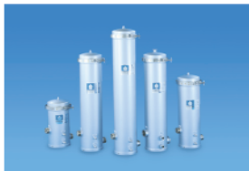
Multi Cartridge Housings