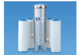
Jumbo Cartridge Housings