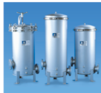
High Flow Multi Cartridge Housings